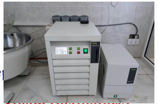
7- أجهزة تبخير خلاصات النباتات (Rotary Vacuum Evaporators)